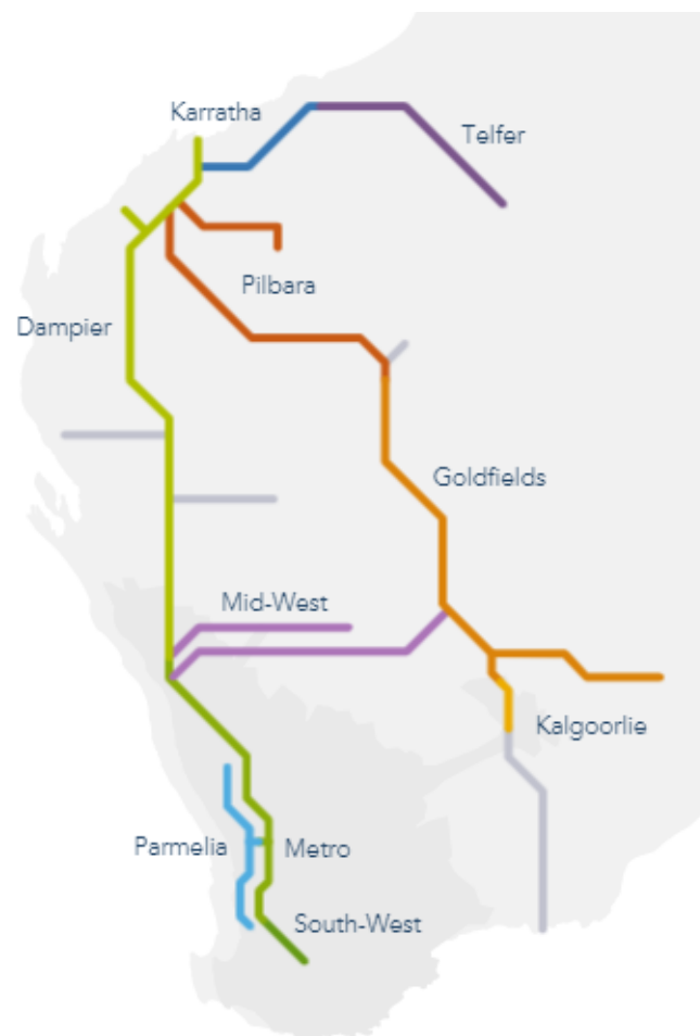
Figure 1 GBB (WA) Network Map

The GBB (WA) map provides a visual display of the gas pipeline network. The map has been updated to display the new Northern Goldfields Interconnect Pipeline in the Mid-West Zone between Dampier to Bunbury Natural Gas Pipeline (DBNGP) and the Goldfields Gas Pipeline (GGP) (Figure 1).